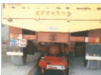
P300 hand pump and 10 ton cylinders used for a vehicle lift.