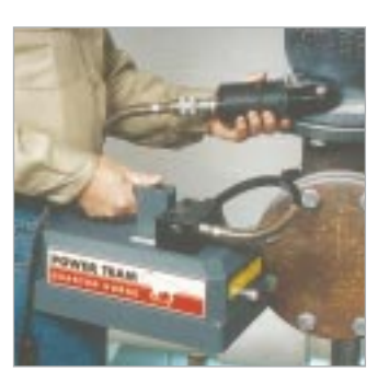
The Quarter Horse pump has a maximum operating pressure of 10,000 psi, which handles a wide variety of hand held hydraulic tools.